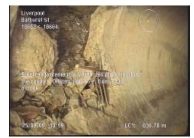
Poor condition. Action needed to prevent ground subsidence and possible collapse.