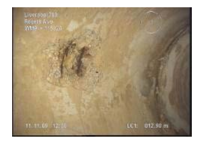
Average condition. To be reinspected in a few years