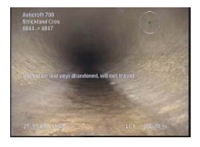
Excellent / Good condition No further action needed

Figure 1 shows examples of stills from CCTV inspection of these pipelines, showing how their condition was rated.