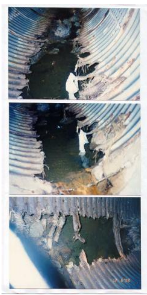
Figure 3: Examples of Invert failure