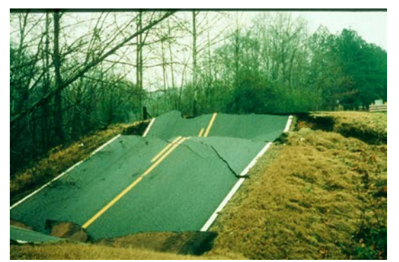
Figure 1: Road damage due to culvert failure

Culvert failure is a much better documented phenomenon than storm drain failure. This is generally because culverts are larger diameter and more exposed than stormwater pipes and hence easier to inspect. Culverts are generally below main transportation routes, creating an additional incentive to ensure that they are not in danger of catastrophic failure. "By far the largest single source of flood loss, on both a monetary basis and in terms of directly affecting the greatest number of people, is damage to transportation infrastructure and utility services. Infrastructure damage also represents the greatest public safety hazard. All of the three flood related fatalities since 1995 were associated with washed out culverts on town highways; although a number of near fatalities have been experienced with residential flooding. Public health and safety is also compromised when access to homes and businesses is unavailable or essential services such as power, telecommunications, fire and rescue, water supply and wastewater collection and treatment are interrupted." - Options for State Flood Control Policies and a Flood Control Program; Vermont Agency of Natural Resources Department of Environmental Conservation Water Quality Division, Waterbury, Vermont January, 1999.