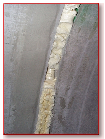
Figure 5: Internal Chemical Grouted Joint