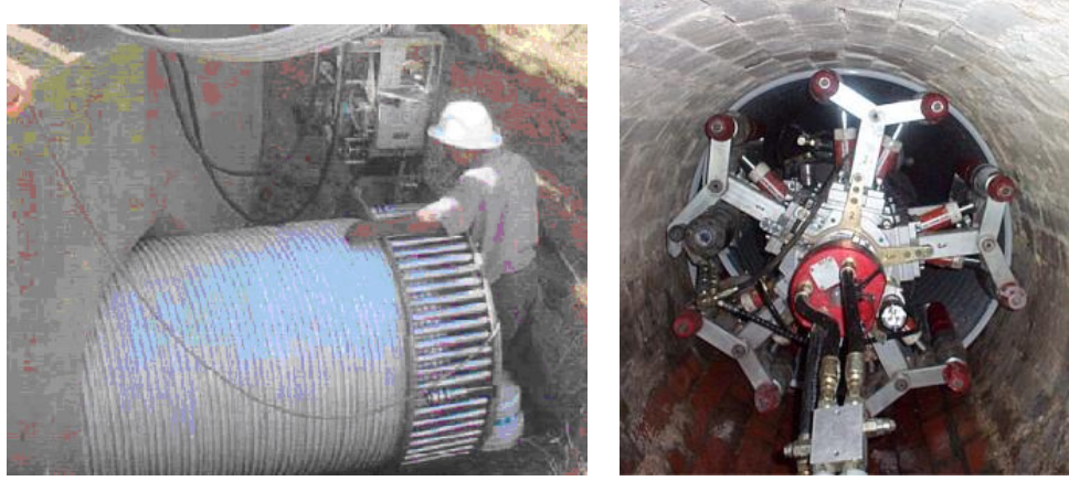
Figure 8: Spiral Wound Full bore lining systems.

Spiral Wound liners are typically made at the entrance, or inside the pipe to be rehabilitated. This process has benefits in traffic control, size of foot print or staging area, flow management of incoming water, speed of installation and environmental benefits associated with eliminating the need for jacking trenches or other excavation. Another chief advantage of these methods is that the finished liner diameter results in minimal cross sectional area reduction.