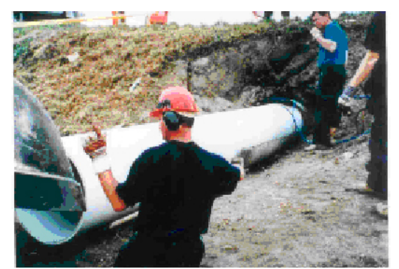
Figure 7: Inserting a PVC slipliner

Sliplining can require a great deal of site and pipe preparatory work before being carried out. The host pipe needs to be prepared to ensure that the slipliner diameter will suit the entire line. Voids in the host backfill should be filled prior to sliplining to control the amount of grout required. Embankment and entry points will often need to be cleared to create a large staging area in order to allow access for long sliplining runs. Sliding rails are also used, although different companies utilise different methods.