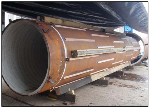
Picture 6: Slots in the steel tube covered while the liner is grouted. The covers were removed prior to it all being inserted into the pressure vessel for testing.

This factor of 20, which can be applied as the "C" value in Equations (2) and (4), above, compares with a value of 7 for grouted liners commonly specified by Australian and New Zealand Water Authorities.