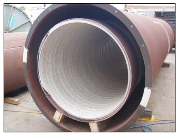
Picture 1: Assembly for the unsupported liner test, prior to placing the end sealing bungs. The Rotaloc liner is located centrally in the cylindrical pressure vessel

Pressure was increased until deformation in the liner reached a stage where the inner surface just touched an indicator bar. This occurred at a pressure of 30 kPa.