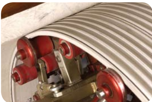
Liner diameter adjustment can be made during winding to ensure the liner is installed tightly against the host pipe.